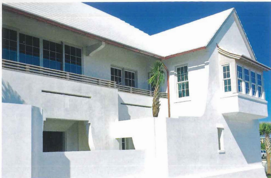
Left: Sanford's architecture can be seen in Alys Beach; her design work in Rosemary Beach as well as other Walton County communities; Primitive Modern furniture is based on classic design with modern lines.