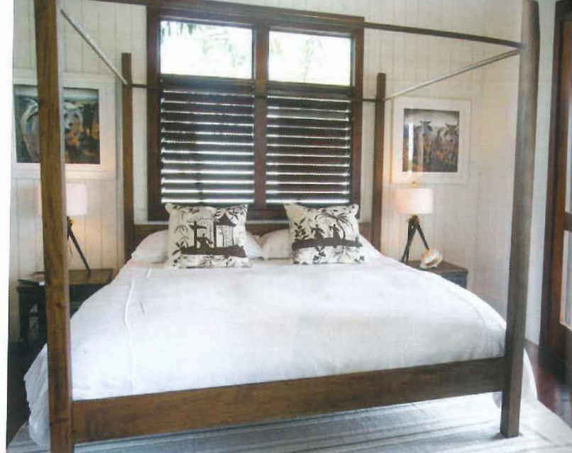
Left clockwise: Mahogany Bay Cottages on Ambergris Cay in Belize; Mahogany Bay room interior designed with her furnishings; Dining room of a Ponte Vedra Beach home; Exterior of Ponte Vedra Beach home designed by Sanford; The Primitive Modern factory in Belize.